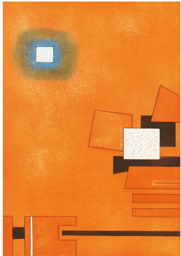
G. Gerzso "SEMBLANZA"